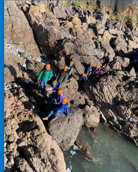
Year 5/6 Residential