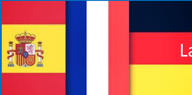
Year 4 Languages day